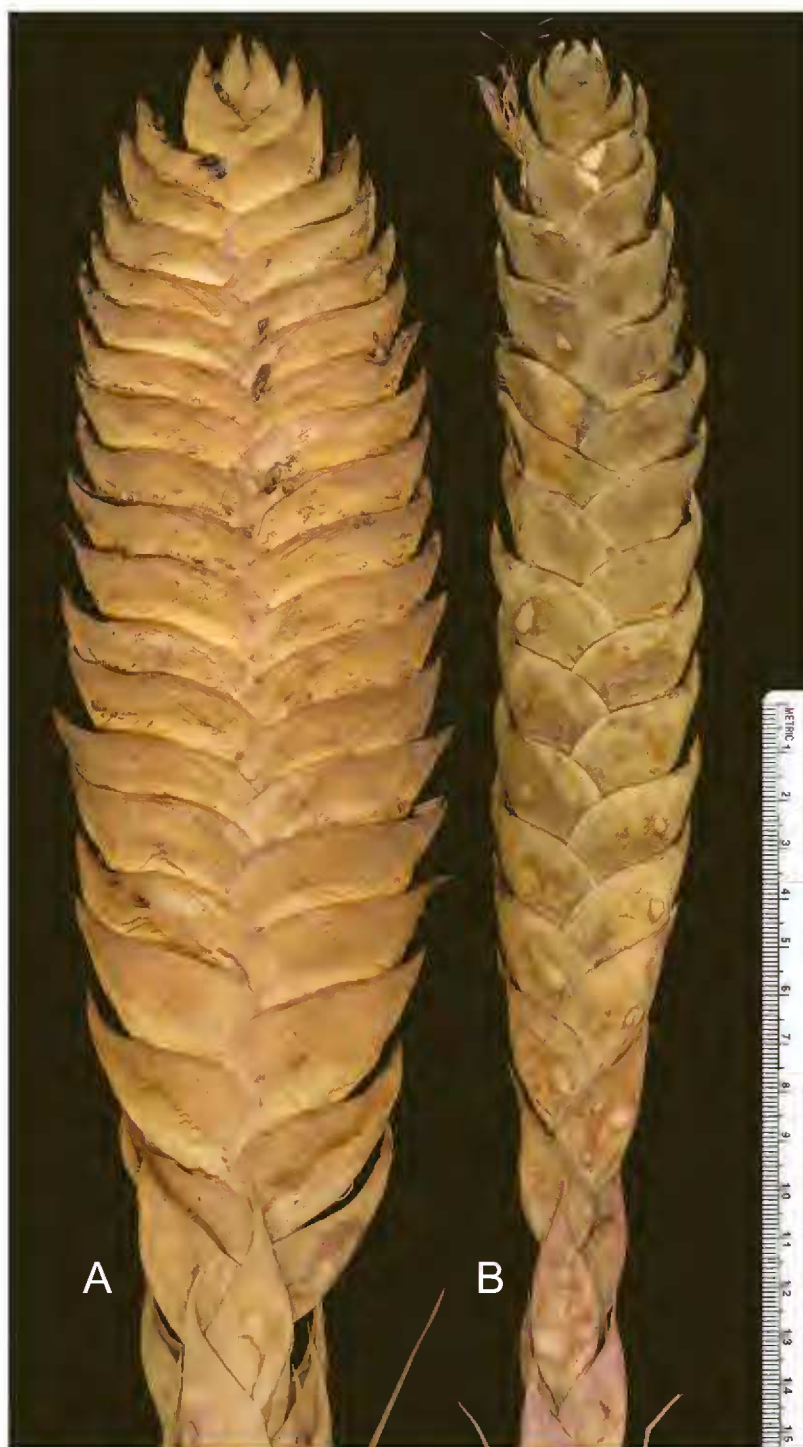
Fig. 3. Dried spikes. A. Tillandsia jaliscomonticola Matuda ( J. Ceja et al. 1473 (UAMIZ)); B. Tillandsia magnispica Espejo & López-Ferrari ( A. Espejo et al. 6312 (UAMIZ)).

Paratypes: Mexico, Oaxaca, distrito de Pochutla, municipio de San Pedro Pochutla, N of Pochutla, 1981, C. S. Gardner 1445 (SEL, US, line drawing by Gardner, 1982); distrito de Pochutla, municipio de San Pedro el Alto, 18 km al S de San Miguel Suchistepec, sobre la carretera a Pochutla, 1700 m s.n.m. Bosque de Pinus